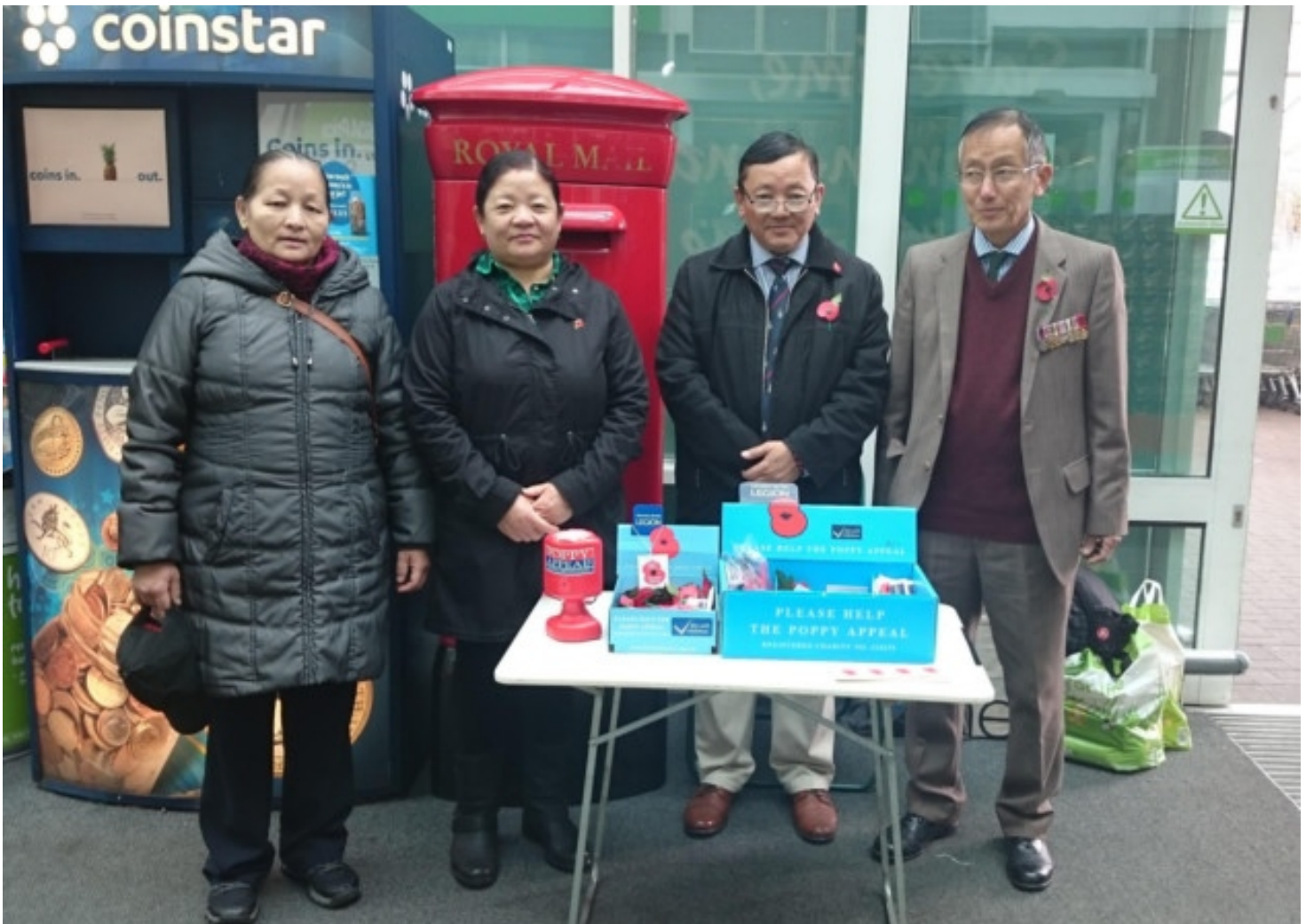
Gurkhas at Wembley's Asda where they collected for the British Legion seven hours a day

The tiny premises of the 78th Squadron Air Cadets opposite Barham Park had only five members turn up for meetings or raise funds last year, not enough to keep going.