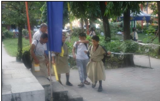
Young Bhutanese boys coming back from school