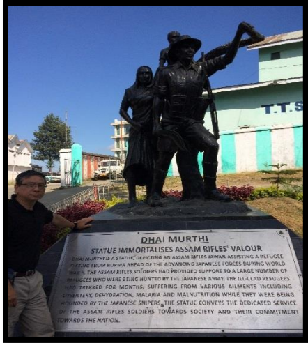
'Dhai Murti' statue at HQ DG Assam Rifles in Kohima