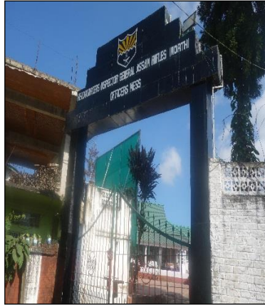
Officers Mess Gate, Assam Rifles, Kohima