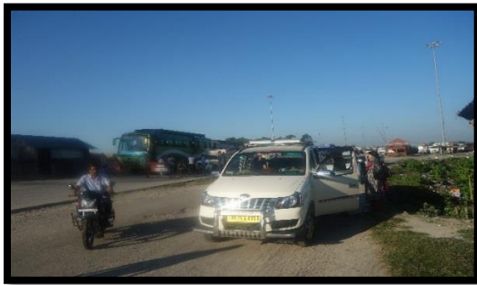
Couple of hour and two 'adhivasi' road blocks later .....