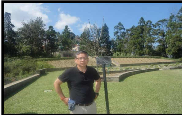
author on the very spot of the lone cherry tree