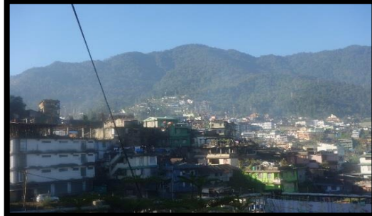
An early morning view of Kohima Town