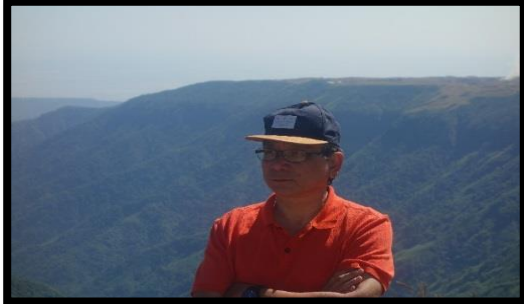
Taking time to stop and admire the view