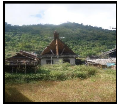
One of the tribal huts in the Naga Heritage Village