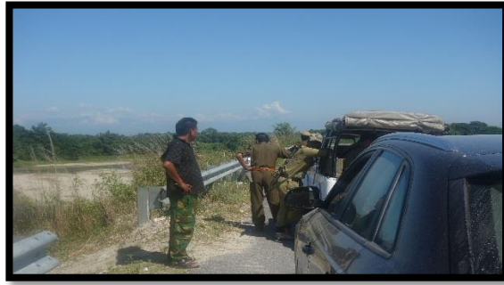
we were finally moving in convoy with Police Escort along the highway