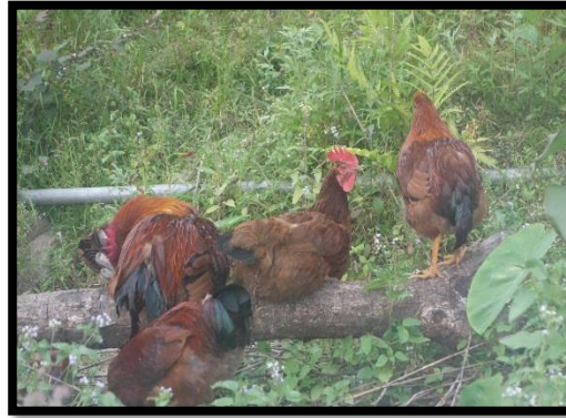
Free range Kampong Chickens for sale!