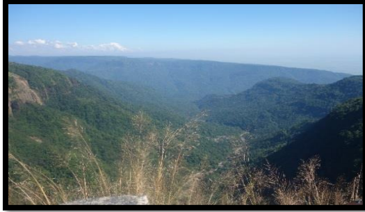
Green Hills of Assam