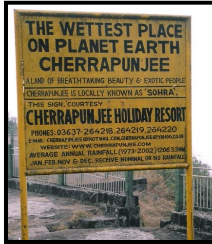
The picture says it all!