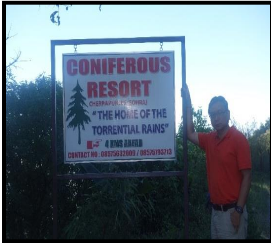
Heading towards Cherrapunji on a sunny day