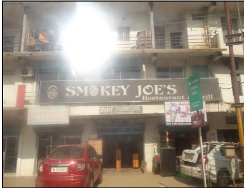
Smokey Joe's in Dimapur - we stopped for a cup of tea