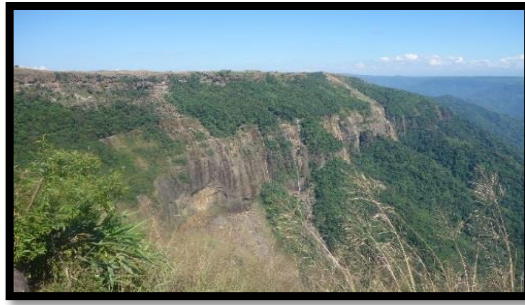
Seven Sisters Falls in Cherrapunji (Assam)