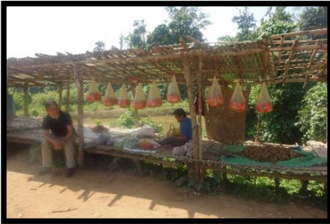
a typical roadside stall selling the world's hottest Naga Chillies!