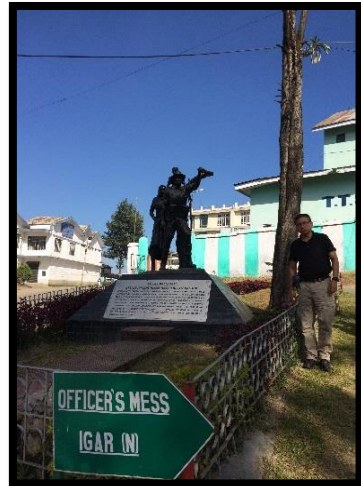
a sign attracts one uninvited guest!