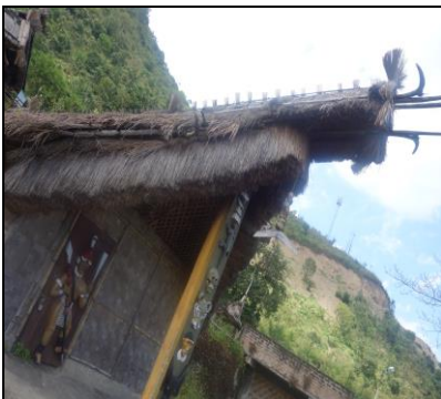
Traditional Naga Hut