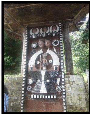
Carved wooden Welcoming gate