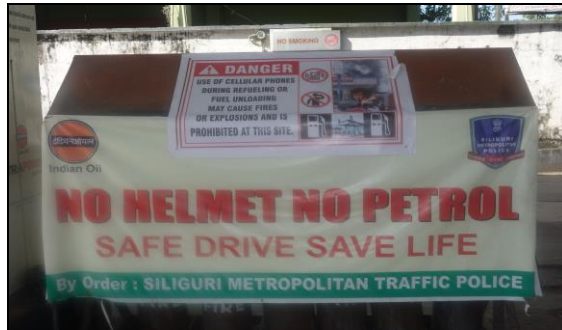
Wearing of helmets is a compulsory for the Motor cyclists to buy fuel!