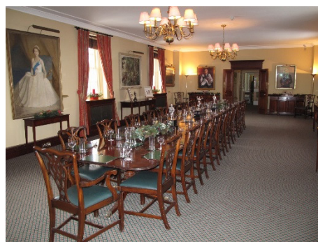
The McDonald Gallery

Cost £30 (£25 for Friends of the Museum)