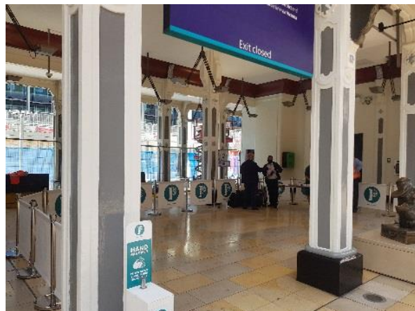
Reception Area under Clock Arch