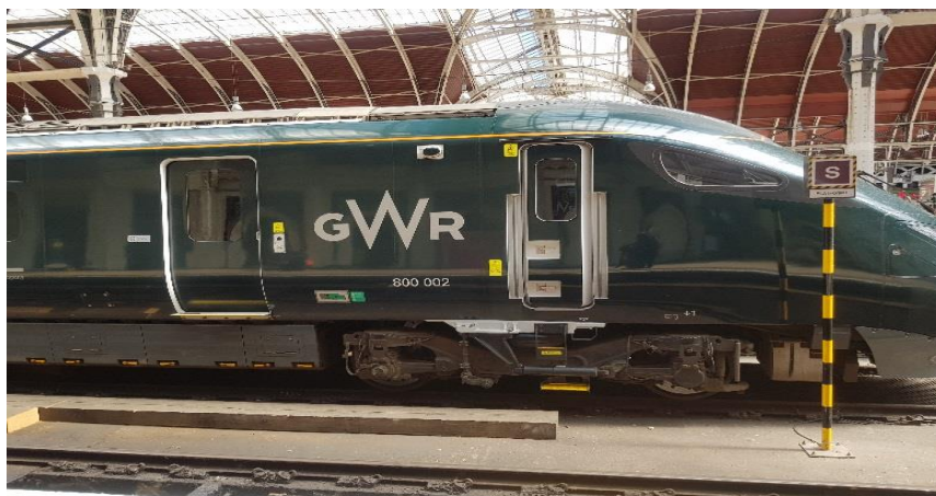
Inter-City Train similar to that to be named: Tulbahadur Pun VC