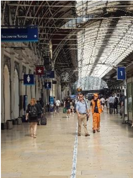
Platform 1 showing Clock Arch